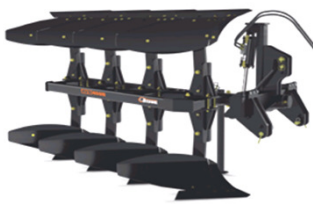
AVB-400 4-Bottom Plow