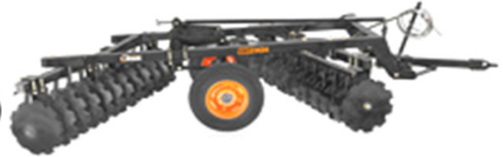
RT Offset Disc