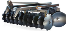
RIB-2022 Offset Disc