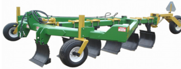
6306 On-Land Plow