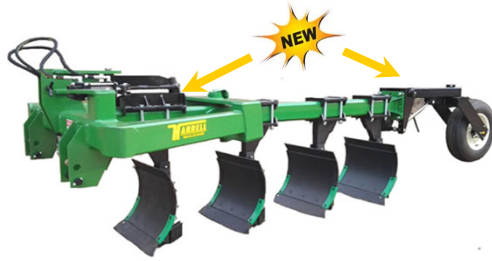
NEW! 9400-Series In-Furrow Plows